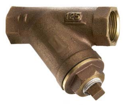
Model 125YTB – Threaded Ends Model 125YSB – Sweat Ends