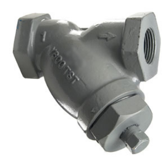
Model 600YTS (Threaded) – Carbon Steel Model 600YSWS (Socket Weld) – Carbon Steel