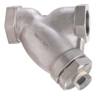
Model 600YTSS (Threaded) – Stainless Steel Model 600YSWS (Socket Weld) – Stainless Steel