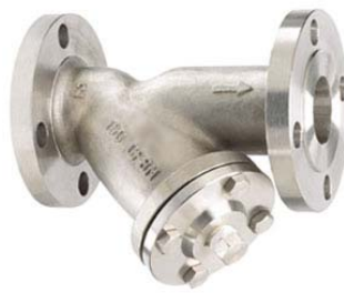
Model 150YFSS – Stainless Steel