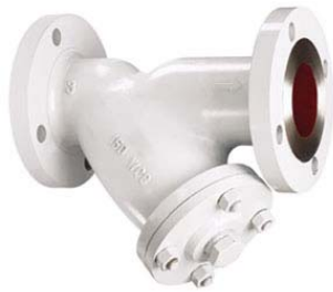
Model 150YFS – Carbon Steel