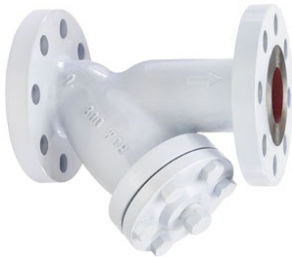
Model 300YFS – Carbon Steel