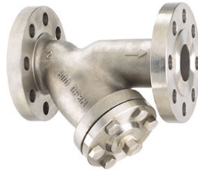
Model 300YFSS – Stainless Steel